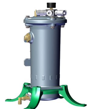
The Radex Filter is housed within the main cannister of the Radex.