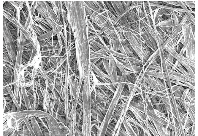
200x magnification