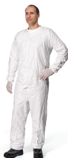
Tyvek® IsoClean® Gown